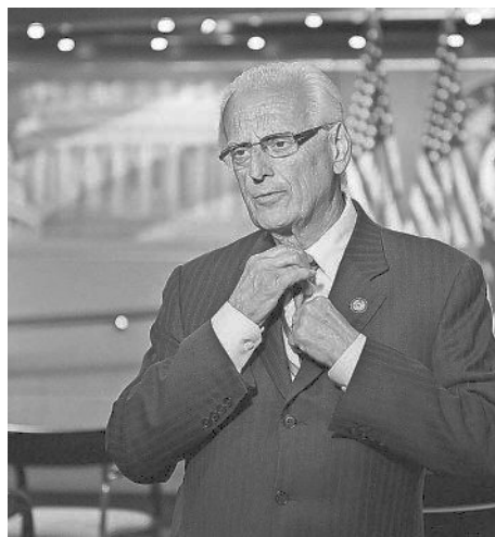
Adjusting his tie, Rep. Bill Pascrell Jr. prepares for a television interview in Washington in 2012, after his election victory over Steve Rothman. Pascrell had a streak of 14 congressional election victories.