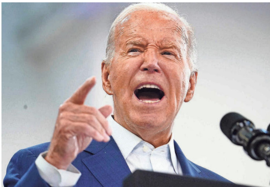
President Joe Biden has flown to his home in Rehoboth, Del., where he will continue to work.