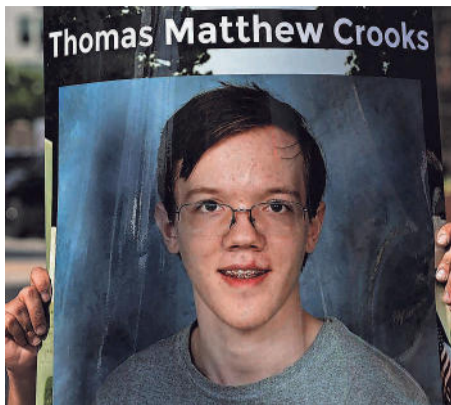
Authorities say Thomas Crooks searched pictures of well-known political figures before Saturday’s shooting at a Donald Trump rally in Butler, Pa.

Trump was speaking Saturday – July 13 – before throngs of supporters at the Butler Farm Show grounds in Pennsylvania when Crooks opened fire from the roof of a nearby building. Trump, his face bloodied, was hustled off the