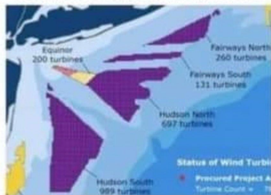
EQUINOR ONLY TALKS ABOUT 147 OF THEM - PRETTY SNEAKY