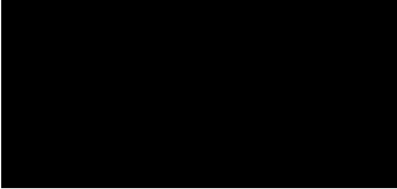
Figure 1: Leading Light BAFO Bids