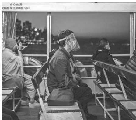
Passengers travel by ferry Monday to the Kowloon side of Hong Kong, the northern portion on the Chinese mainland. China’s easing of COVID restrictions began in November.

The easing began in November and accelerated after Beijing and several other cities saw protests over the restrictions that grew into calls for Presi-