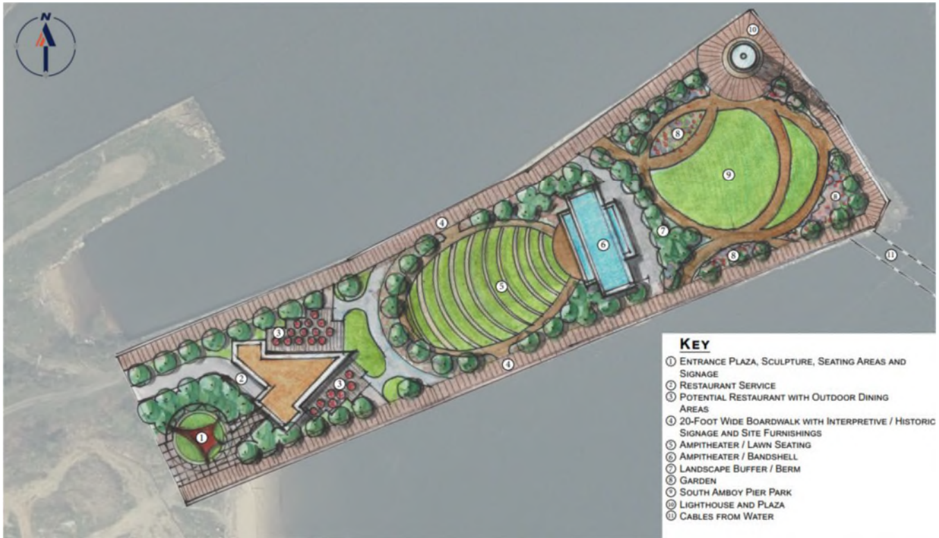
Proposed South Amboy Pier Park